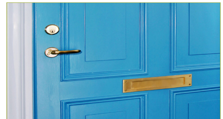
BESPOKE ACCESS CONTROLS AND LOCKING SYSTEMS