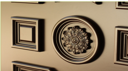
UNIQUE SASH DESIGN WITH EACH PROJECT

Working closely with architects over the years has continually highlighted the architectural design of the ever-important Front Door. Ensuring exterior doors also provide a residential home with the standard of security required for peace of mind and protection, without compromising on aesthetic, is a delicate balance.